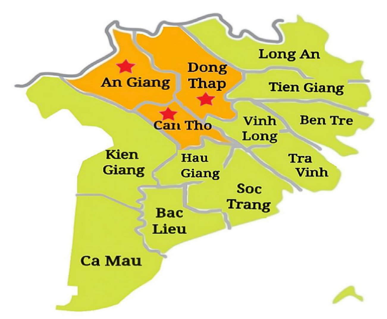
Fig. 1 Sampling and interviewing locations such as An Giang, Can Tho and Dong Thap provinces of the Mekong Delta (red buttons), Vietnam

cooking method, etc. The survey data were analyzed by @RISK (version 8.1, Palisade Corporation, USA).