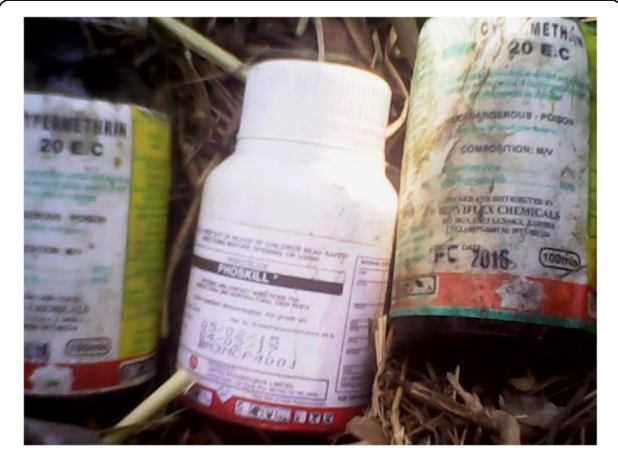
Fig. 3 Pesticide containers in vegetable field

As ZEMA, we are concerned with the lack of knowledge on how to handle, use and dispose of agro-chemicals in the country. We are now working with various institutions to enhance knowledge and understanding on how to use agro-chemicals (Zambia Daily mail article December 15, 2015).